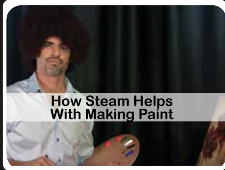
How Steam Helps With Making Paint