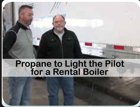
Propane to Light the Pilot for a Rental Boiler