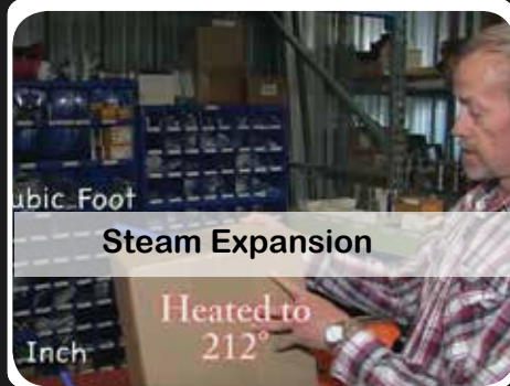
Cubic Foot Steam Expansion Heated to 212° Inch