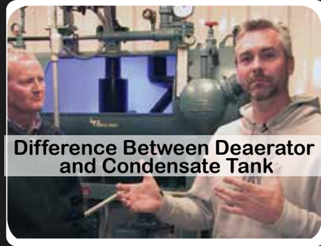
Difference Between Deaerator and Condensate Tank