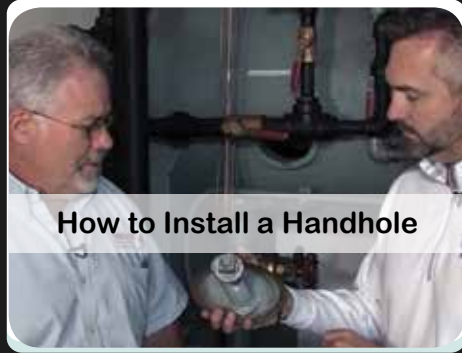
How to Install a Handhole