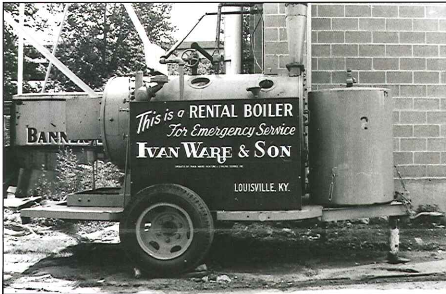
One of Ware's First Rental Boilers